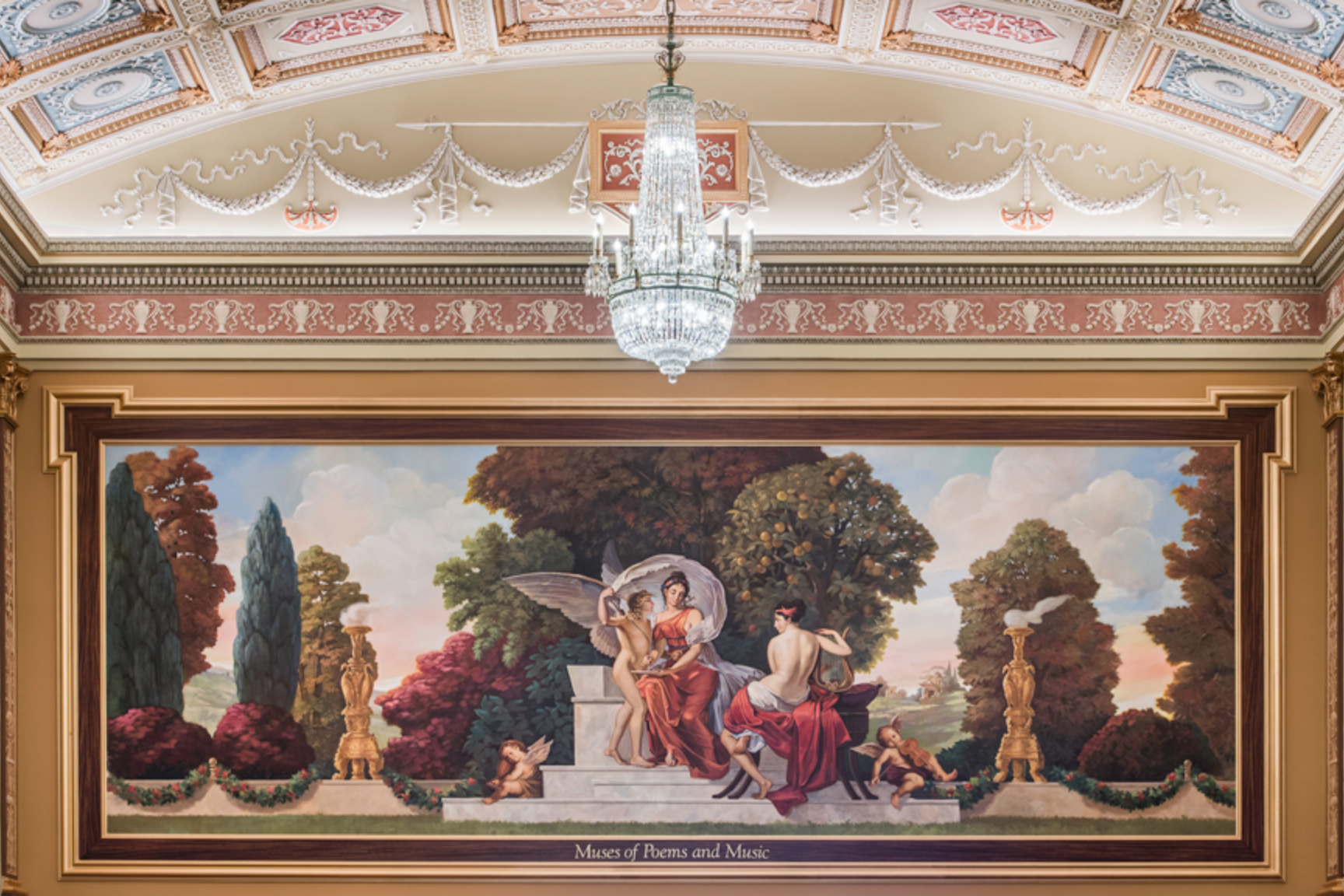
Muses of Poems and Music